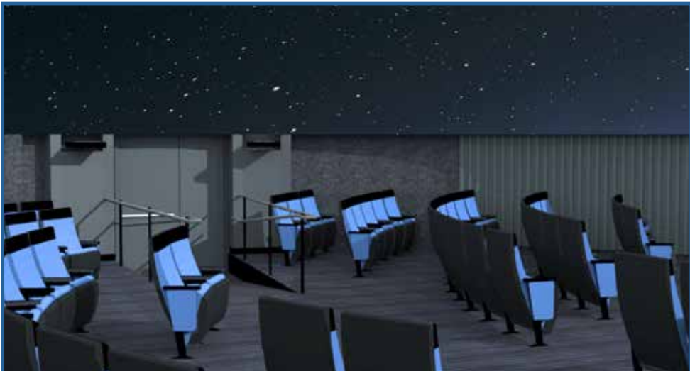
Dave Diabold Architects